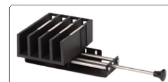
manual 4-cell holder (optional)