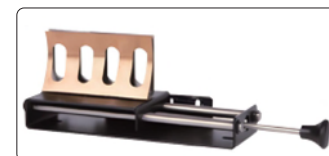
manual 4-position film holder (optional)